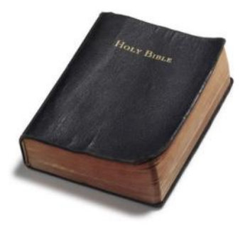
The Bible is the Word of God